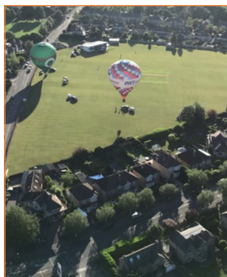
The Glasshouse Academy Grounds Home to Bear Flat and Combe Down cricket clubs