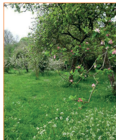
Broadmoor Lane Orchard and Play Park